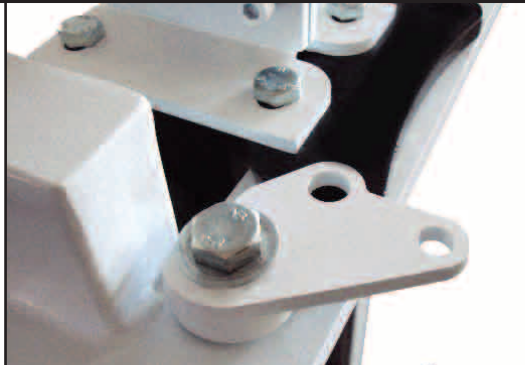
LOCKABLE CATCH IN BOTH UP & DOWN POSITION